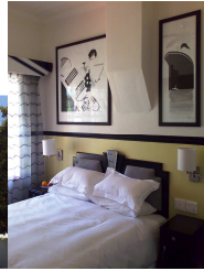
Typical rooms and bathroom.