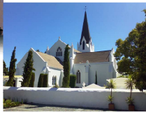
View from back garden.